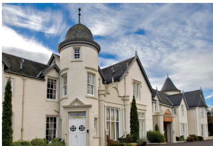
Kingsmills Hotel (First Class) Inverness, Scotland

Located about a mile from the city center, this First-Class hotel was originally built in 1786 for the Provost of Inverness, who was visited by Robert Burns on September 5, 1787. Burns's letter thanking the Provost is on display in the reception area. Amenities include a restaurant, lounge, health spa, and swimming pool. Your room includes a telephone, TV, and coffee- and tea-making facilities.